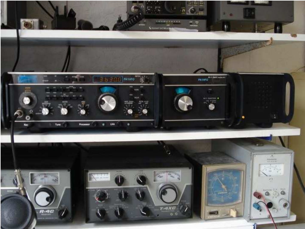
Marc's new version of a modernised and modified TR7 with multicolour frequency display and the PTO replaced by a DDS VFO.